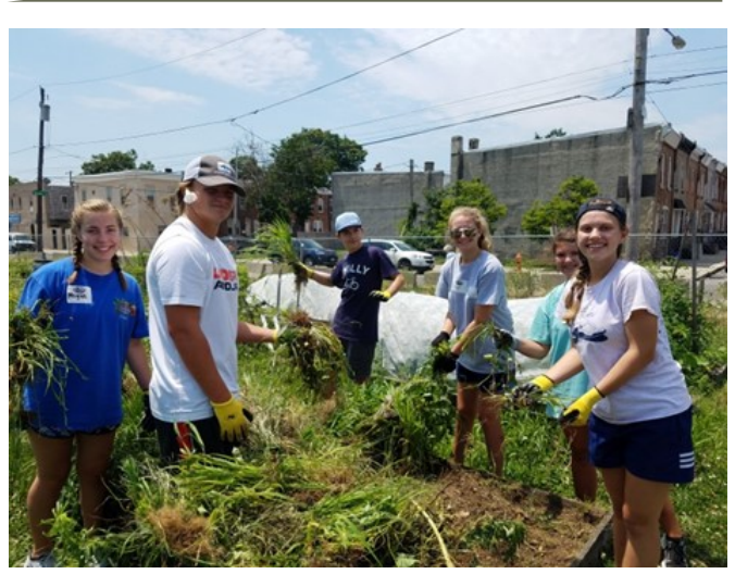
Six youth and two adult leaders spent a week this summer week serving in Philadelphia—see page 9 for details and more pics of love in action on inside back cover!