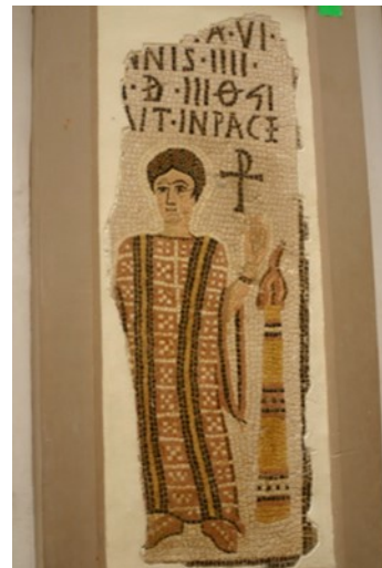
An early Christian mosaic of a pastor praying with a Paschal Candle

Understand, therefore, beloved, how it is new and old, eternal and temporary, perishable and imperishable, mortal and immortal, this mystery of the Pascha : old as regards the force but new as regards the Word; temporary as regards the model, eternal because of grace perishable because of the slaughter of the sheep, imperishable because of the life of the Lord; mortal because of the burial in earth, immortal because of the rising from the dead.