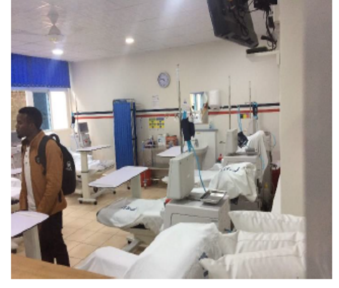
ALMC's New Dialysis Unit!